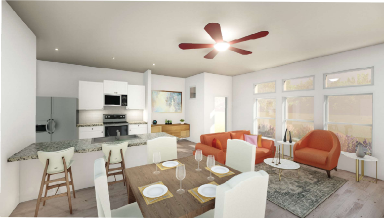
Living Room View